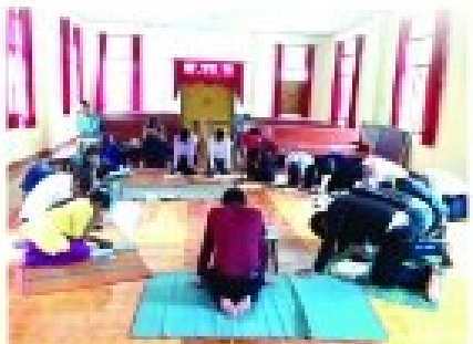
Mi, yeh' nga' -ah' khu' -eu, ga' kaw'