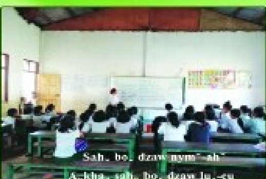
Sah' bo' dzaw' nym' -ah'