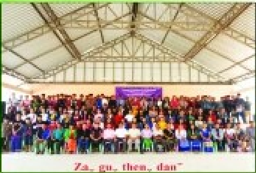
Za, gu' then' dan'