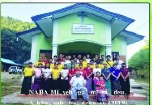
NARA Mi, yeh' sa' m' sa' deu' A, kha' sah' bo' dzaw' -eu (2019)