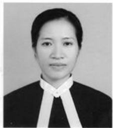
Daw chaw phu'-eu

A' yui, a' nyi' Kha li za' deu-o', naw ma, yaw_gha, na lu, -ah' ABC dzaw' ga'-eu seu_gha' heu ta, neh daw_ chaw_ phu_ ma. Yaw_gha, na lu, jaw' sa' do^-aw' la_ qha_ cheh'-eu je_ byah lu, -u'!