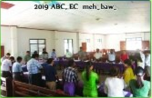
2019 ABC, EC meh' baw'