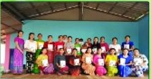
A, kha' sah' hu' meh' -eu (Grade 1) sa, la, dzaw pyeu' -eu then' dan'