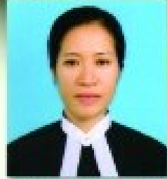
Daw chaw phu' -eu