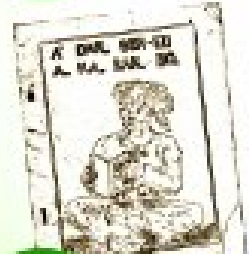
Ia, ga' haw' -eu m' msa' msa' lya' sa' a' (Pa' II, Yo' lu', 50400)